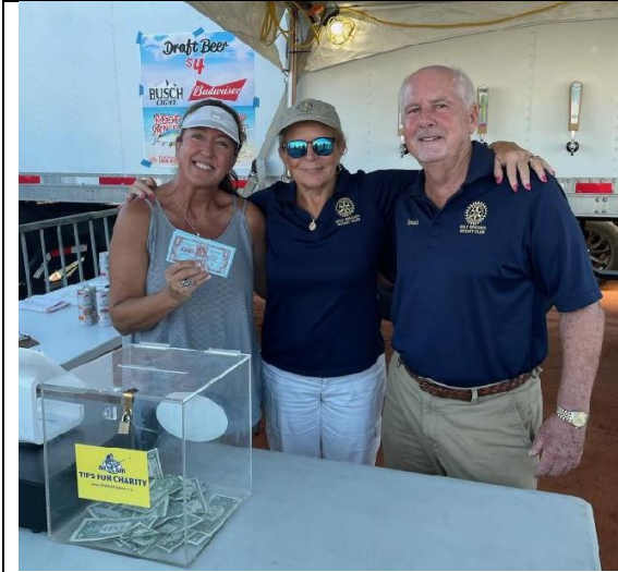
Rotary assisting Old Salts at fishing tournament, November 17 th .