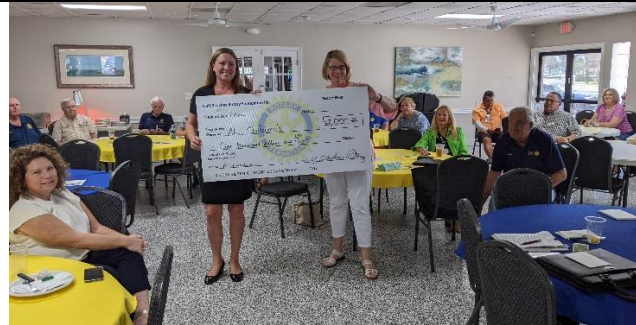
Big Check to All Children's Hospital Guild