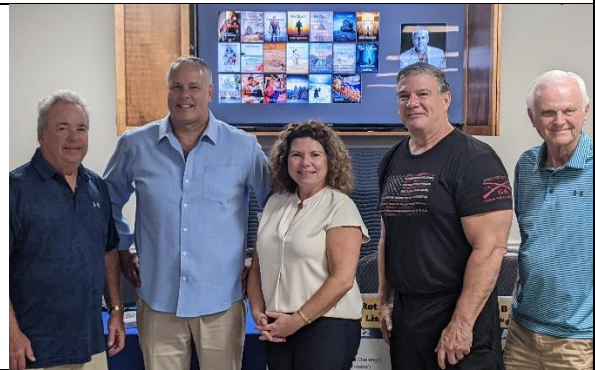
Trouble On Treasure Island? Not with these leaders in charge!